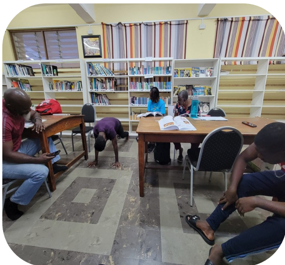
P E & Sports Class in action