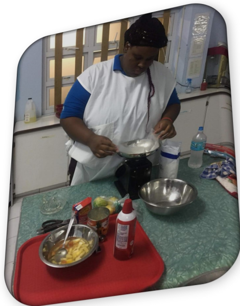
Food & Nutrition 100% passes